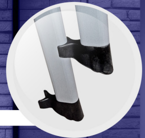
Leg Connectors Stacking