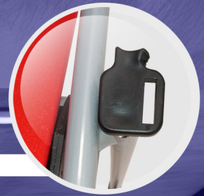
Bracket for Connecting Chairs